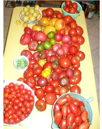
Patty's 2010 Harvest of Heirloom Tomatoes

Patty's will be having a hands-on workshop on canning her homemade salsa the old-fashioned way. Participants will take part in chopping onions, tomatoes, sweet and hot peppers by hand, sterilizing containers, cooking, filling jars and sampling their work. Everyone will take home a small jar of salsa. There will be room for only 6 to 8 people so sign up is a must. 2 hour class, cost $20.00. Date will depend on ripened tomatoes. More info to come.